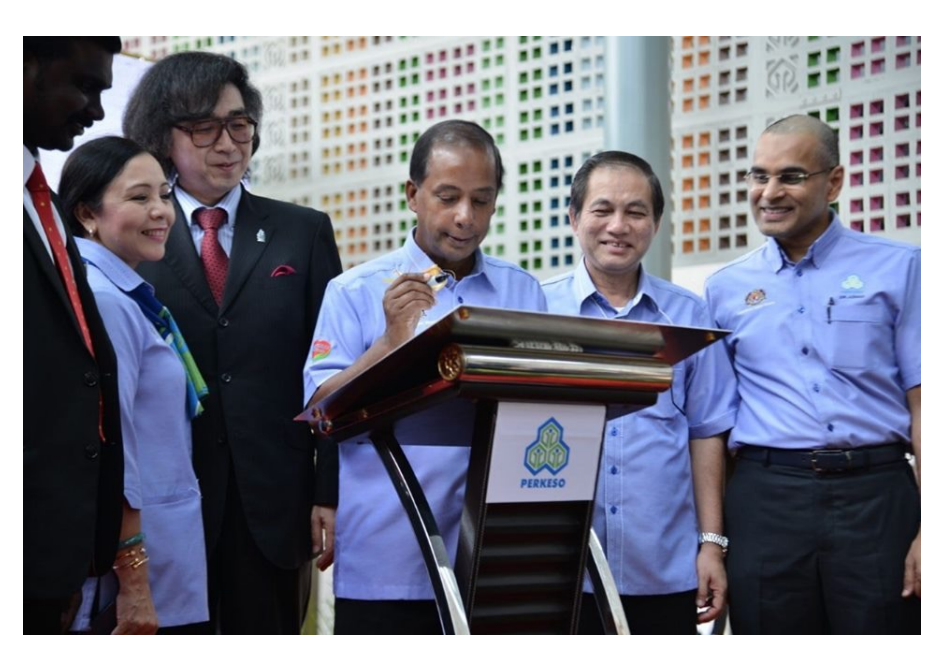
May 13, 2019 "Neuro-Robotics Rehabilitation and Cybernics Center" opening ceremony

As announced in the press release on October 16, 2018, Cyberdyne's cutting-edge treatment robot, HAL for Medical Use Lower Limb Type as well as HAL Single Joint Type and HAL Lumbar Type were introduced to a rehabilitation center operated by Social Security Organization of Malaysia (SOCSO) in November 2018. On May 13, 2019, this SOCSO rehabilitation center invited Malaysian Human Resources Minister M. Kulasegaran and held an opening ceremony of "Neuro-Robotics Rehabilitation and Cybernic Center" as one of Cyberdyne's central base for Cybernic Treatment and training of HAL professional for its operation in South East Asia.