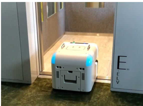
CL02 riding on the elevator

*SLAM stands for Simultaneous Localization and Mapping