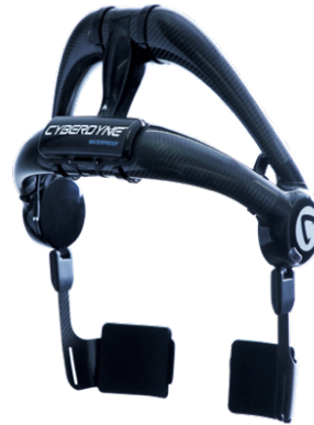
HAL Lumbar Type for Labor Support

HAL Lumbar Type for Labor Support is a one variant of a “Wearable Cyborg” which connects to the brain-nerve system of the wearer and functions as if it is part of the body, just by wearing the product. The product is used in distribution warehouses, construction sites and airports to reduce the workload when one lifts a heavy weight. By reducing the workload, the product can reduce the risk of picking up back pain. As the product is waterproof and dustproof, it is now used to support workers in disaster relief. As a basic function, the product is equipped with communication function that covers all areas of the building and wide range outside, the product is also part of the IoH/IoT network.