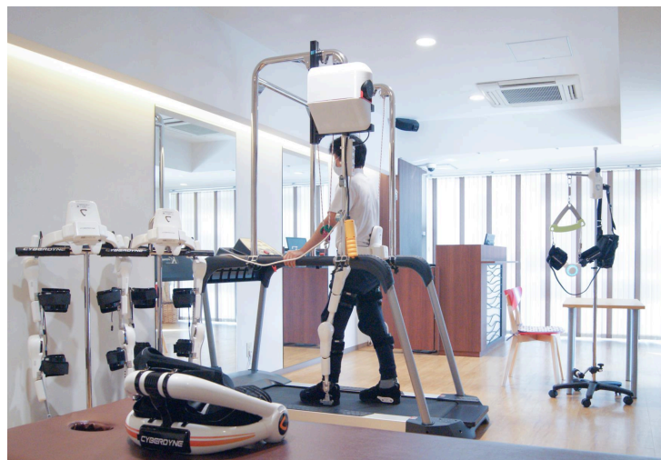
Image of Robocare Center

For the Neuro HALFIT program offered in the related Robocare Centers, some private insurance contracts *2 and shareholder benefits *3 can be used. Upon using the aforementioned scheme, there are certain conditions, which would be applied, so please check the appendix for the details.