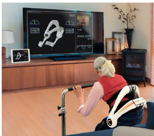
Image of training with HAL monitor

HAL is now connected with CYBERDYNE cloud system. This enables visualization of information of bioelectrical signal and postural information. The wearer can not only obtain visual feedback but also receive quality support from their therapists and trainers remotely.