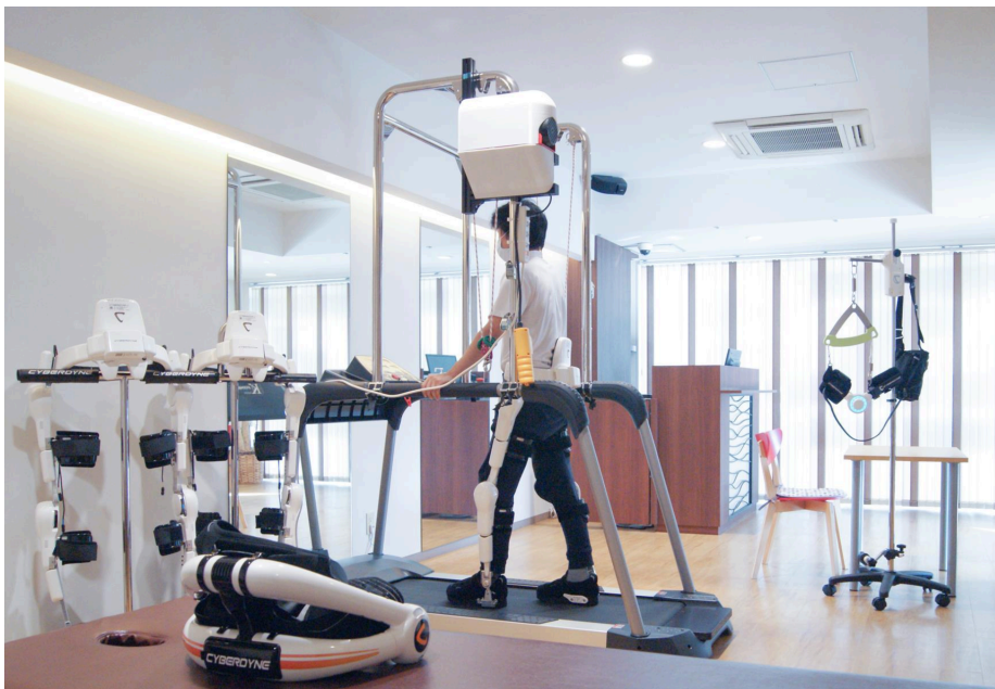
Inside of Fukuoka Robocare Center

Similar to other Robocare Centers, Fukuoka Robocare Center offers the Neuro HALFIT service to visitors with reduced physical function or visitors with a disability, in order to induce improvement in the function of the brain-nerve systems. In this program, Wearable Cyborg HAL is put on wearers who have difficulty standing, sitting or walking on their own, to support movements based on the wearer’s own intent of movement.