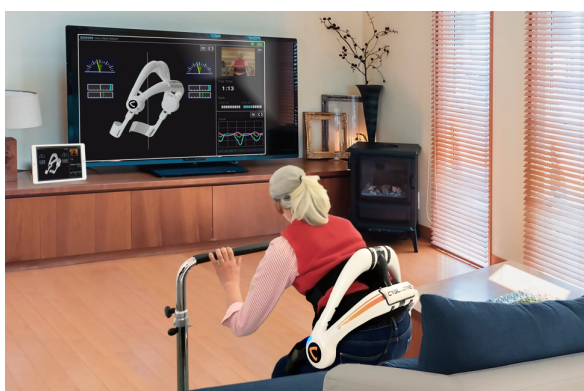
Image of using Neuro HALFIT at Home

Due to restrictions related to COVID-19, the Company recognizes many individuals who are experiencing a loss of opportunity to work out or reduced exercise amount. The service helps individuals induce improvement of brain-nerve-musculoskeletal function through their daily exercise with HAL and staying healthy.