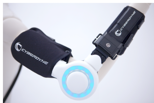
HAL at Home Single Joint Type